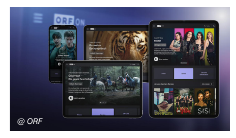
ORS successfully implemented the entire livestreaming for the ORF ON library.