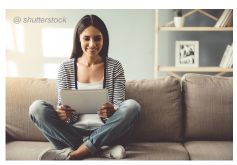
Whether it's livestreaming, catch-up TV or event streaming – ORS has a wide range of video streaming products available