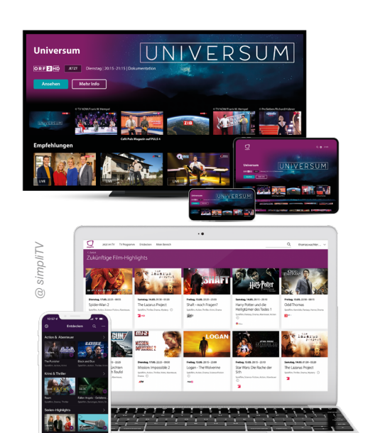
Flexible and location-independent television on laptops, smartphones and tablets with simpliTV streaming.