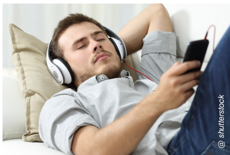
Radio streaming makes content available via the Internet.

More and more, radio consumers expect to be able to listen whenever and wherever they want. With its extensive expertise in streaming services, ORS can meet this demand in the best possible way and implement radio streaming solutions comprehensively and competently.